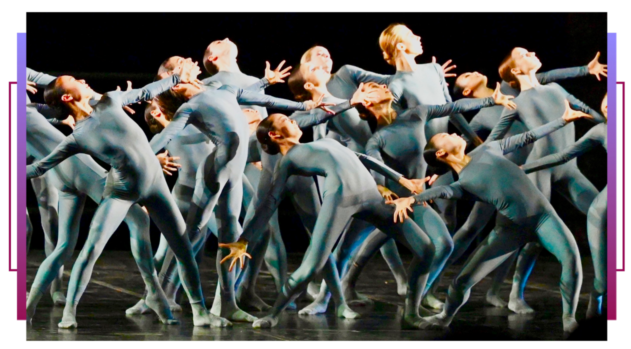
YAGP 2022 NERVI FESTIVAL PARTICIPANTS IN GOYO MONTERO 'S DURER'S DOG (ABOVE) AND OHAD NAHARIN 'S EXCERPT FROM DECADANCE (BELOW).

The YAGP "Future of Dance" Gala will allow ballet enthusiasts to see some of the most promising young dance students from around the globe. Both performances will feature all Nervi program participants in the signature YAGP piece d'occasion, the Grand Defilé.